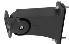
SQUARE/ROUND POLE ARM