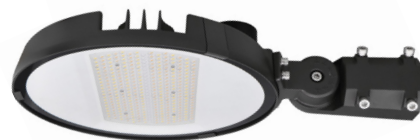
Slipfitter mounting (sold separately)