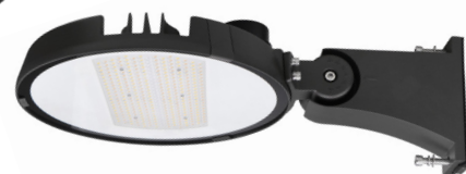
Square/Round pole mounting (sold separately)